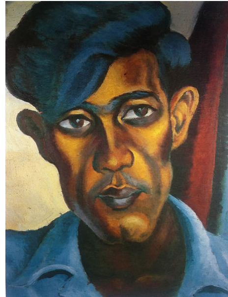
ARTWORK: IRMA STERN: ARGENTINIAN WOMAN 1941. OIL ON CANVAS, 51 X 61 CM ARTWORK: GERARD SEKOTO: A PORTRAIT OF A CAPE COLOURED SCHOOL TEACHER, OMAR, 1943. OIL ON BOARD, 50,5 X 58 CM